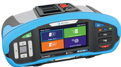
Metrel InstalTest XD.